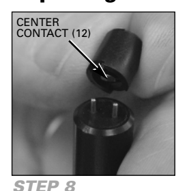
Place the CENTER CONTACT (12) on the TOOL (20) making sure the pins of the TOOL (20) are in the holes of the LOWER INSULATOR (13).

*Note: make sure the SIDE CONTACT (11) and CENTER CONTACT (12) are in the switch.