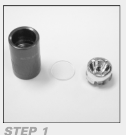
These are the components of the HEAD ASSEMBLY (1), HEAD (2), LENS (4), REFLECTOR (5).