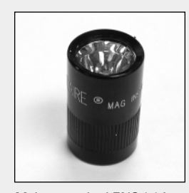
Make sure the LENS (4) is seated evenly.

Push down firmly applying firm even pressure until the LENS (4) and REFLECTOR (5) meet the LENS (4).