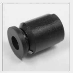
Replacement switches come assembled.